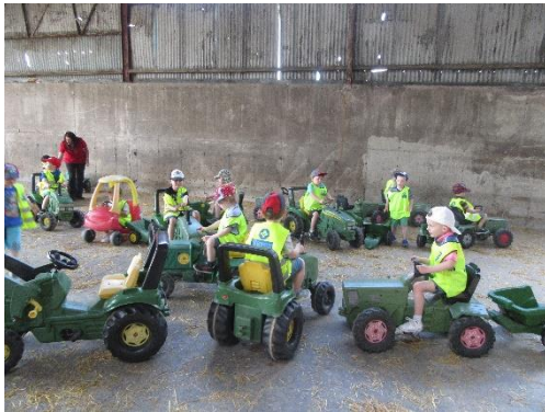
Fun On The Farm

Our final outing of the Preschool Year was to Newgrange Farm in Co. Meath on June 3 rd . It was hugely successful. Our fears over having torrential rain all day were removed when it turned out to be a beautiful day. The Preschool Teachers were quite calm during the outing, mainly because of all the tranquillisers they were munching like Smarties. For the first time ever, we arrived back almost on time, and everyone was safe and sound but pretty tired! Thanks to all the parents that helped out on the day. You were a huge help.